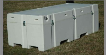
Optional Lightweight Rotationally Molded Composite Shipping Container

The CAMSS Rotationally Molded Container is also available for storing and shipping the CAMSS20Q. This lightweight, weather-tight container, measuring 40" wide x 102" long x 48" high, is stackable and forkliftable. One complete shelter, with set up tools, will fit in a container and four containers will fit on one 463L pallet for air shipment.