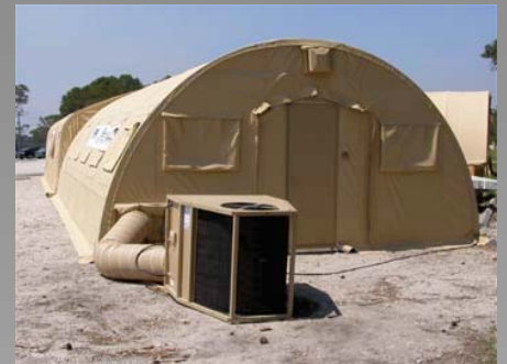
Exterior with Optional Environmental Control Unit