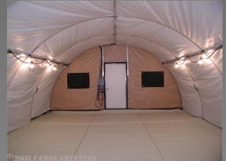
Interior with Quick Connect Lighting