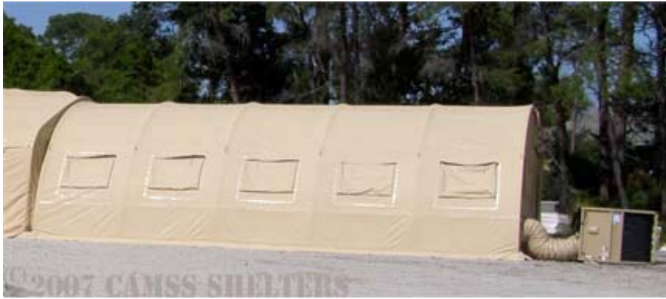
CAMSS20Q Shown Complexed to a CAMSS20EX

The CAMSS20Q is a highly portable, ruggedized, all-weather, military shelter system that is designed for rapid worldwide deployment. Two-inch deep aluminum arch frame components and rugged Mil Spec fabric provide a durable, lightweight shelter with a significant wind and snow load capability.